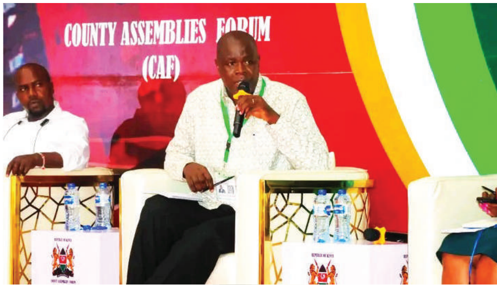
Speaker of the County Assembly of Bungoma, Hon. Emmanuel Situma among the panelists for a session at the 6th Legislative Summit 2026, as he addressed issues on legislative oversight

enhance the effectiveness of County Assemblies. Hon. Situma called for the improvement of salaries for Members of County Assembly to enable them to effectively execute oversight on governors and county executives. He noted that the implementation of County Assembly autonomy will help address previous challenges where assemblies had to seek approval from County Executive Committee Members (CECMs) for payments—a situation that compromised their independence.