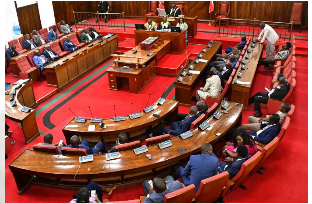
FILE PHOTO: Members of the County Assembly of Bungoma attend a plenary session.

and status of these proceedings as required by law during the vetting process.