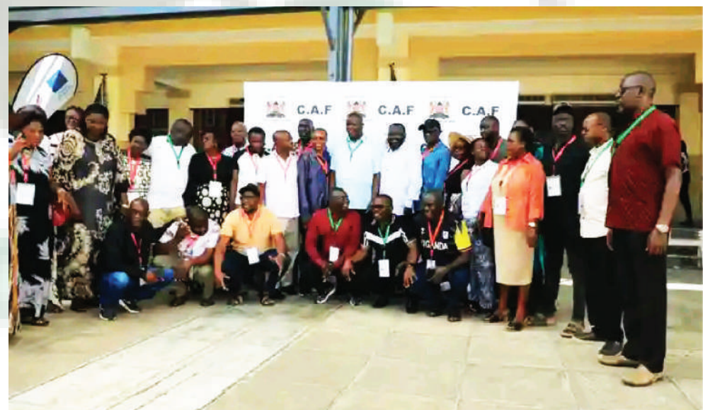
Bungoma County Senator Hon. David Wafula Wakoli joins County Assembly Speaker Hon. Emmanuel Situma and Members of the County Assembly for a photo on the sidelines of the 6th Legislative Summit in Mombasa.

The delegation of Hon. MCAs, led by the Leader of Majority Hon. Joseph Nyongesa reaffirmed their commitment to advancing the county's legislative agenda and pledged to work collaboratively in fulfilling their mandate.